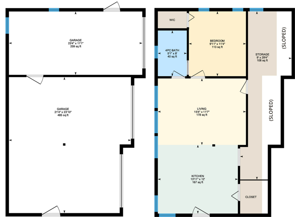
SUITE ABOVE GARAGE: 799 SQFT

6419 Dogwood Ln - Harrison Hot Springs, BC